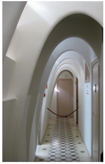
Casa Battlò top floor hallway

HOLISTIC + GENERATIVE APPROACHES = CREATIVE + SUSTAINABLE SOLUTIONS