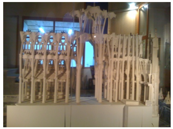
Structural model of parts of the cathedral

HOLISTIC + GENERATIVE APPROACHES = CREATIVE + SUSTAINABLE SOLUTIONS