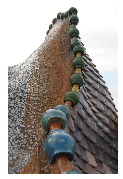
Casa Battlò "dragonback" roofline

HOLISTIC + GENERATIVE APPROACHES = CREATIVE + SUSTAINABLE SOLUTIONS