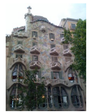
Casa Battlò, street view

HOLISTIC + GENERATIVE APPROACHES = CREATIVE + SUSTAINABLE SOLUTIONS